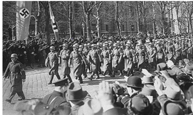
Nazis marching past enthusiastic crowds in Austria

Increasingly alarming for Austria's Jews are the shouts of "Heil Hitler!," "Perish Judea," and "Down with the Jews," heard throughout the streets of Vienna and smaller towns.